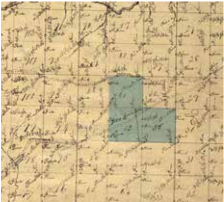
Left: section of Muscogee County land lottery survey of 1827 showing lots in District 15 that are now the Fall Line Sandhills Natural Area (blue). The path of the Federal Road is shown passing diagonally through the lower left lot. This property is located about a mile west of Butler on GA-90.

Muscogee County, District 15, Feb. 7, 1827; District Plats of Survey, Survey Records, Surveyor General, Courtesy of the Georgia Archives.