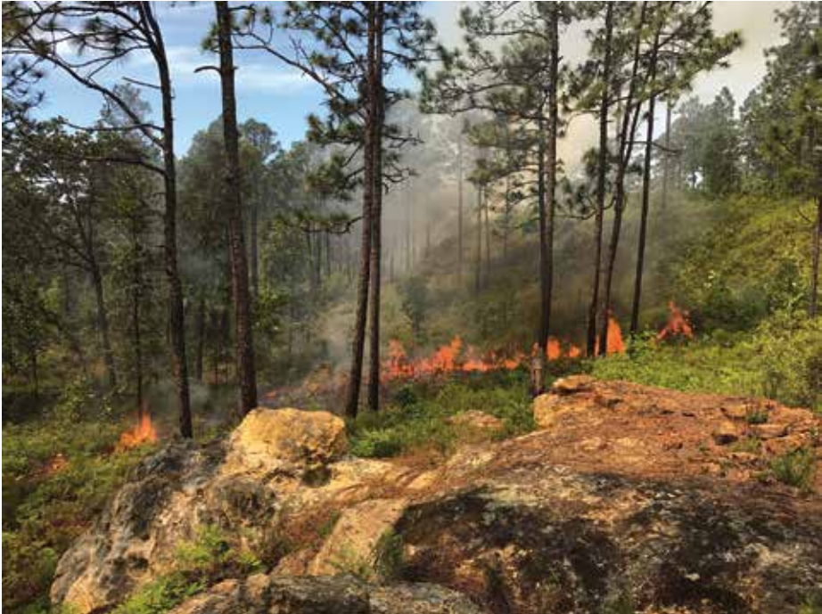
Above: the Georgia Department of Natural Resources is using prescribed fire to return the Chattahoochee Fall Line and Fall Line Sandhills to the natural Long Leaf Pine ecosystem.

For anyone wanting to retrace Bartram's footsteps through this region it is important to note that between US-19 north of Butler and Mauk there are no modern roads, dirt or otherwise, that follow the Federal Road. West of downtown Mauk (such as it is) the old Federal Road coincides with Mauk Road and Fort Perry Road. ❁