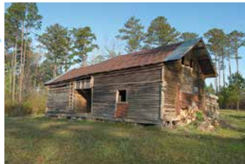
Anderson's Stage Stop is the only remaining structure from the days of the Old Federal Road. It was built in the early 1840s and occupied until the early 1950s.