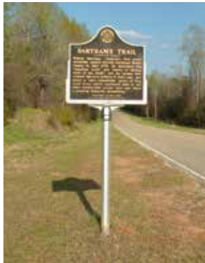
Bartram Trail historical marker on Shirling Lake Road in Butler County.