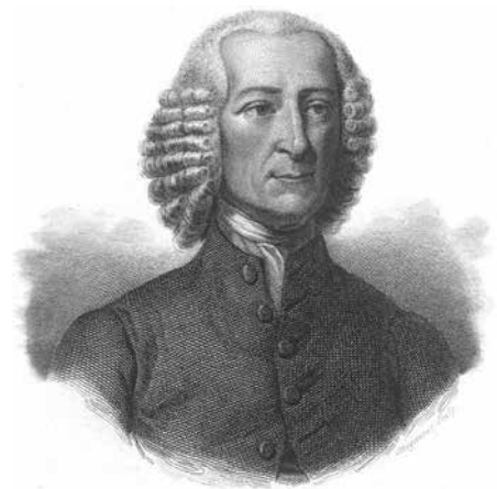
John Fothergill, 1712–80

My dissertation uncovers the formative role that animals and specimens played in eighteenth-century natural history in the Americas. While previous studies emphasize the human activities of natural history, my project flips the script by making corals, rattlesnakes, fish, and raccoons its protagonists. I applied for the Fothergill Research Award to support several chapters of this dissertation—and in particular my