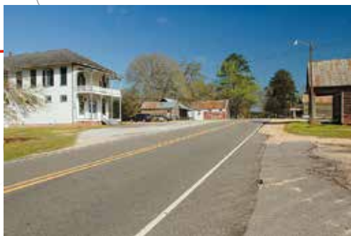
Burnt Corn. County Road 5 is a modern section of the Old Federal Road and divides the town between Monroe County to west and Conecuh county to the east. This is part of the early trading path from the Upper Creek Towns to Mobile and Pensacola.