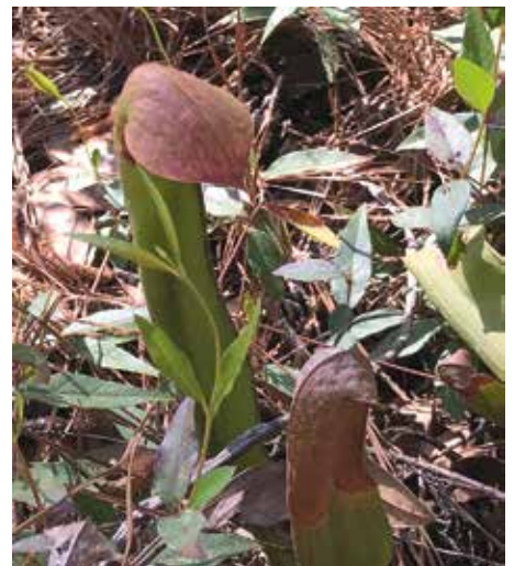
Hooded Pitcher Plant, Sarracenia minor

The program kicked off on a bright, brisk afternoon with a round-trip boat cruise from the northern tip of St. Simons Island upriver to Altama Wildlife Management Area, managed by the Georgia Department of Natural Resources and The Nature Conservancy. Despite gusty winds, huge alligators basked in the shelter of