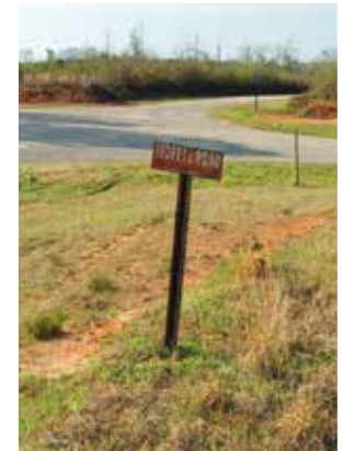
The Old Federal Road is marked along the Monroe-Conecuh county line with these directional signs.