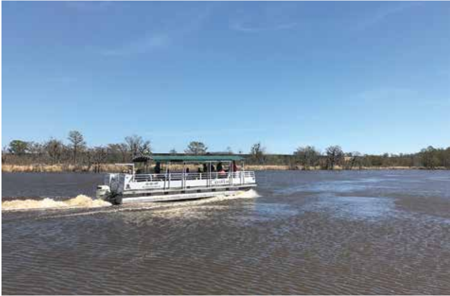
"O peaceful Alatomaha, gentle by nature. How thou art ruffled."

marsh grasses, reminding us of those William experienced firsthand further south in Florida. Disembarking at the historic Altama Plantation, the group walked along an abandoned rice dike to note the change in vegetation types from freshwater grasses, through river