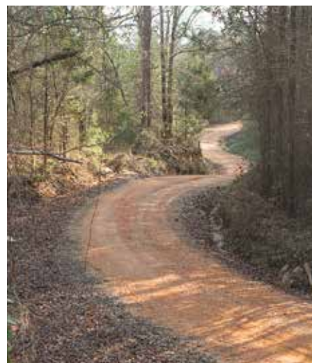
Remnant of the Old Federal Road near Middleton Cemetery

The landscape through which Bartram travelled is, of course, much altered from the landscape that he described. Today much of the route is surrounded by pine plantations with the occasional bucolic scene of contented cows and lush green pasture. When we reach the southern part of