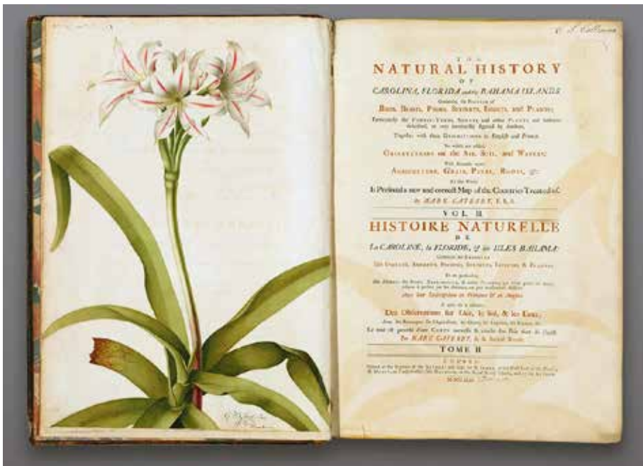
Mark Catesby's Natural History , from Arader Galleries web site https://tinyurl.com/yvgbm25g