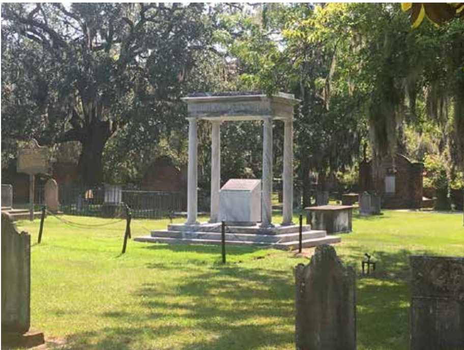
Button Gwinnett memorial and possible location of his grave