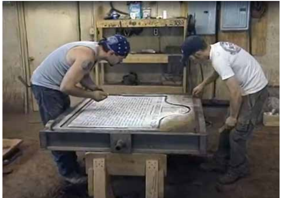
Preparing the mold at Sewah Studios