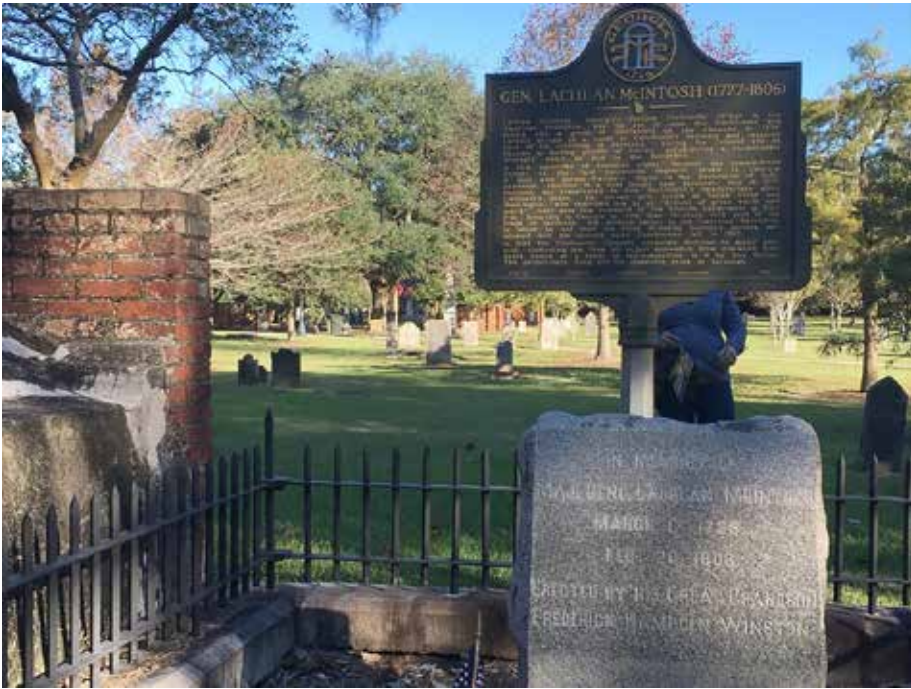
Lachlan McIntosh's grave

In 1927 Mr. E.M.Hawes, an individual with an intense interest in sharing local histories, and historical roadside marking, determined to utilize the relatively new technologies for castings of light-weight, inexpensive, corrosive resistant and strong