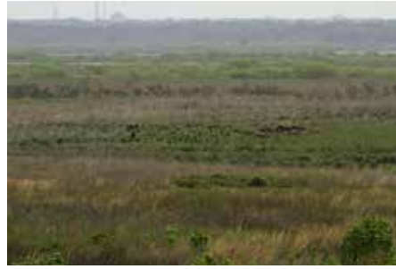
Alachua Savannah (Payne's Prairie)