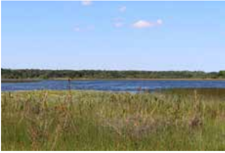
Halfway Pond (Cowpen Lake).