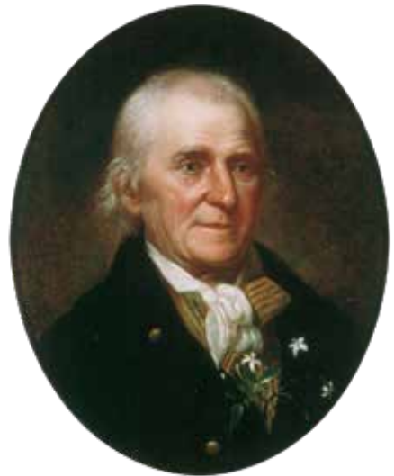
William Bartram by Charles Willson Peale (1808)