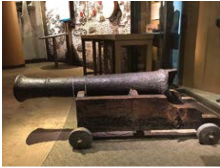
Cannon from Fort Toulouse