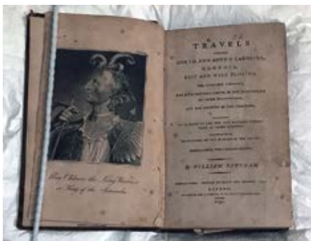
First edition of William Bartram’s Travels in the Alabama Department of Archives and History.