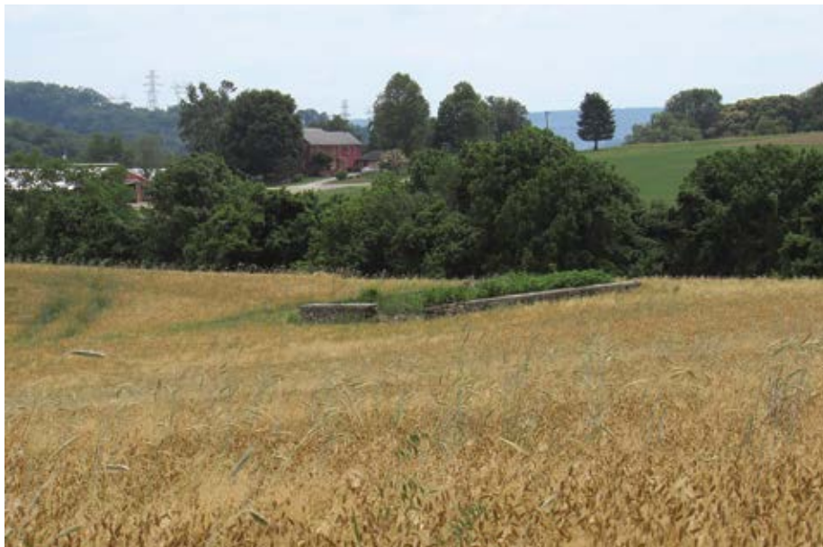
Wright family cemetery, Lancaster County, Pennsylvania