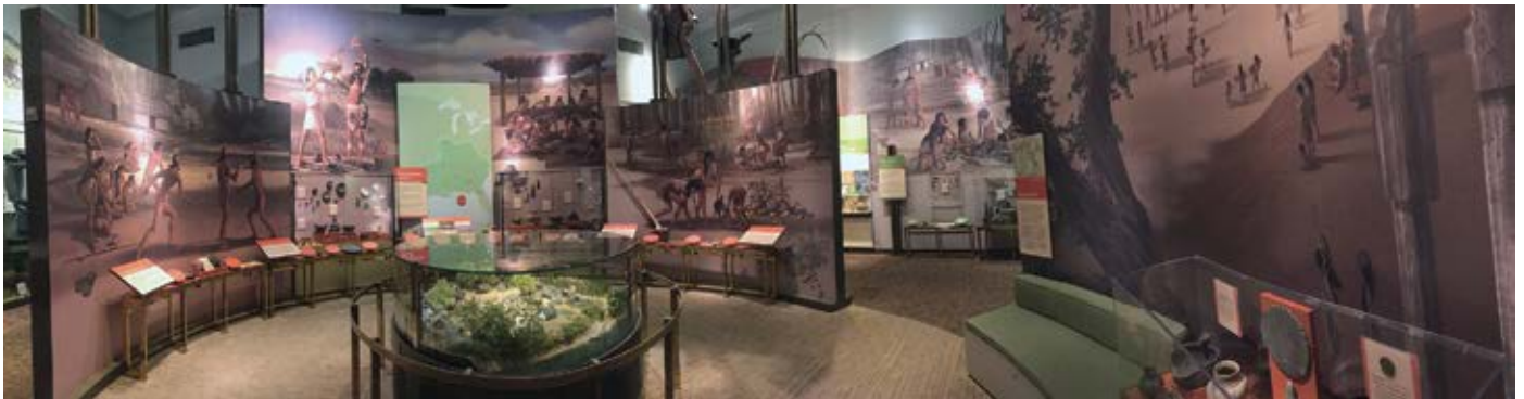
The Museum of Alabama

Bartram enthusiasts from across America converged on the stately Alabama Department of Archives and History in Montgomery for our biennial conference October 25–27. This site was particularly appropriate because it holds the Bartram Trail Conference archive in its collection.