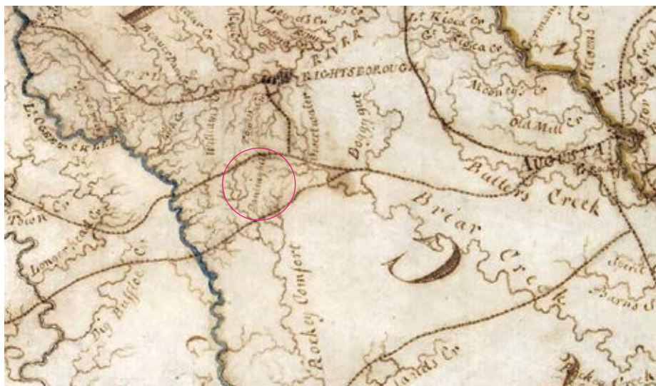
The circle indicates the location of Dancing Hill on Rocky Comfort Creek. However, is it pointing to the upper or lower path?

liniar leaves, somewhat resembling those of the Delphinium or Ipomea quamoclet ; from about one half its length upwards, it sends out on all-sides, ascendent branches which divide again and again; these terminate with large tubular or funnel formed flowers; their limbs equally divided into five segments; these beautiful flowers are of a perfect rose colour, elegantly be-