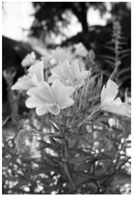
William Bartram's "most pompous and brilliant herbaceous plant" Oenothera grandiflora blooming at Bartram's Garden on the morning of September 5, 2008.

I'm not sure if the rather late bloom time is natural for this species, or the result of drought from mid-summer onward, or repeated attacks by Japanese beetles. During July it was possible to pull handfuls of beetles off the plant daily. The plant survived the period with riddled leaves, but continued to grow. The common evening primrose, Oenothera biennis , has been blooming elsewhere at the garden and in weedy