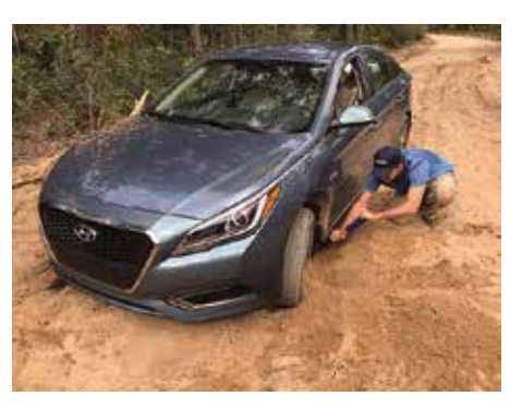
Digging out the car on the Bartram Trail.