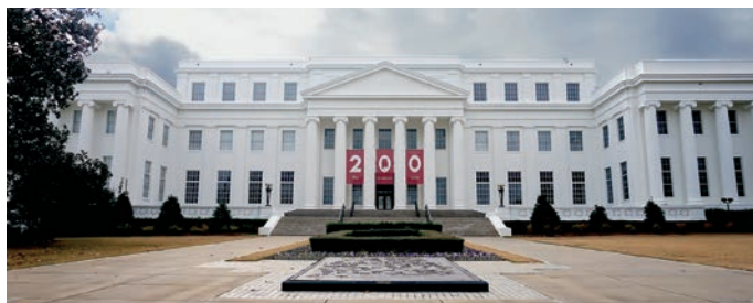
Alabama Department of Archives and History.