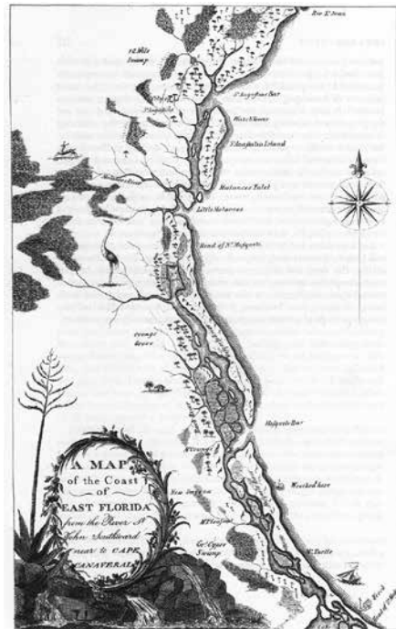
A Map of the Coast of East Florida by William Bartram