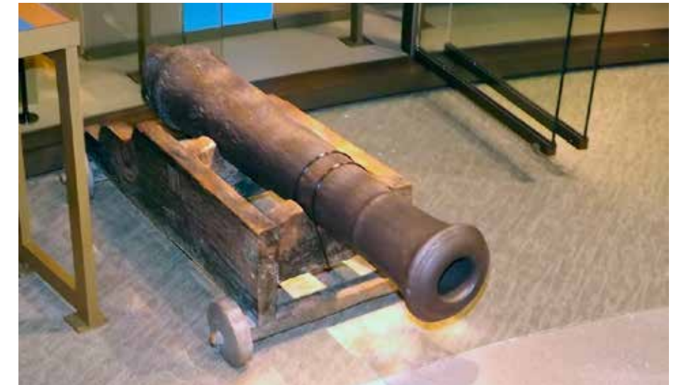
Ordnance abandoned at Fort Toulouse by the French, observed by Bartram