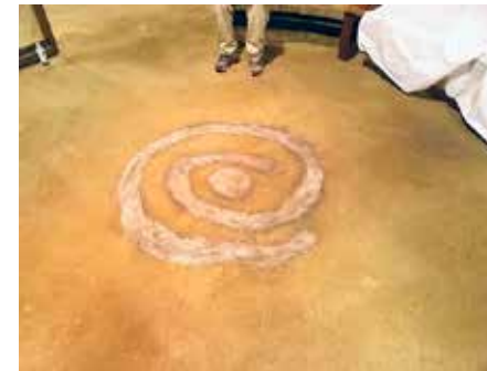
Bartram mentions the spiral fire on the floor of a Creek town's rotunda, represented through this image on the floor.