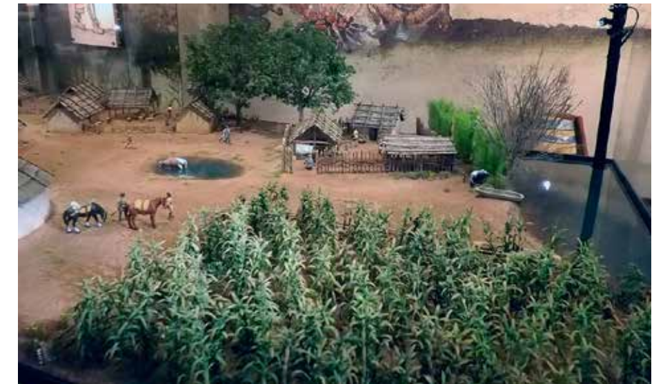
Diorama of Typical Creek Town

writings are incredibly valuable for their wide range of topics as well as the minute details about ordinary things. We consulted Bartram for specifics about clothing, foodways, architecture—you name it—throughout the long planning phase. His work was particularly helpful for the diorama, when his precise descriptions, supplemented by his drawings, were used along with archaeological findings as well as the testimony of other first-hand observers to produce a fine visual representation of a Creek town that Bartram would immediately recognize."