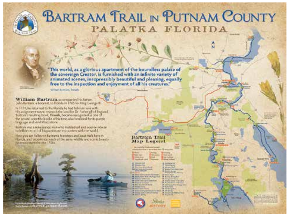
Bartram Trail in Putname County kiosk located on the St. Johns River in downtown Palatka, Florida.