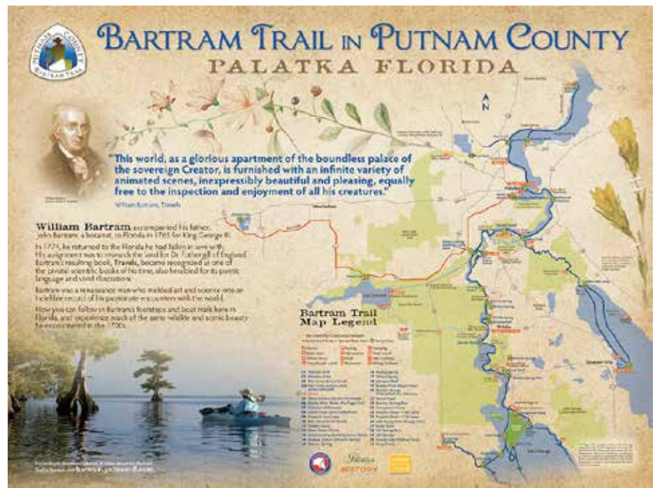
Bartram Trail in Putname County kiosk located on the St. Johns River in downtown Palatka, Florida.