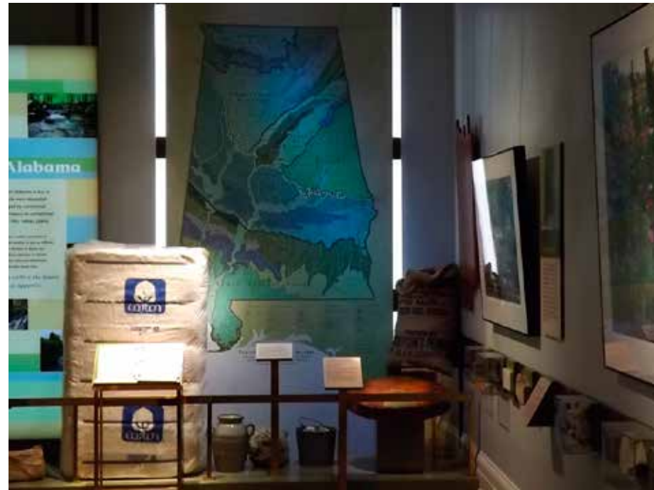
The Land of Alabama Exhibit