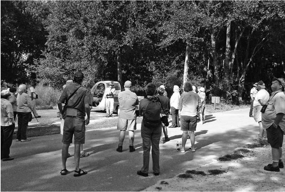
Sunday morning began with a walk into Bartram's Alachua Savannah at Paynes Prairie State Park.