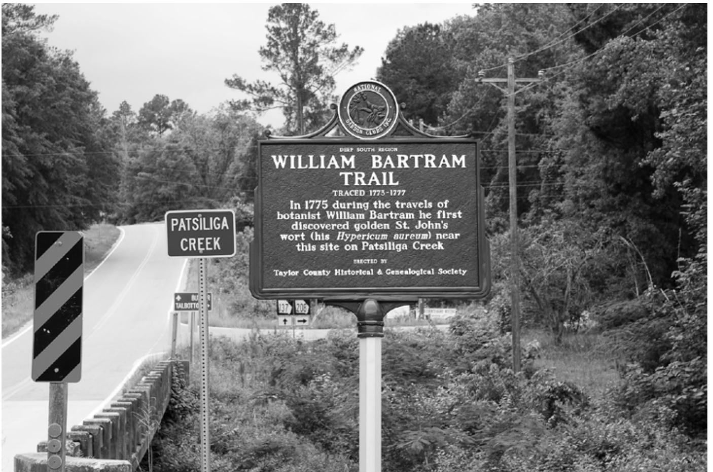
Bartram Trail Historical Marker at Ficklin's Mill, Taylor County, Georgia