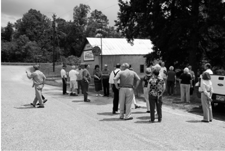
Members of the Taylor County Historical and Geneological Society enjoy a Sunday afternoon gathering to dedicate the new Bartram Trail Historical Marker