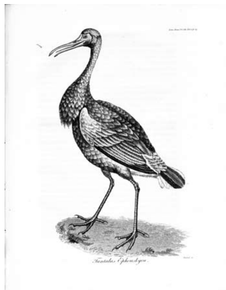
Bartram's limpkin, used by Benjamin Smith Barton as the frontispiece to "Some account of the Tantalus ephouskyca, a rare American bird," an essay that he read before the Linnean Society of London in 1815 and published in 1818. ]

At Huntoon Island, we walked beneath gnarled oaks and stately palms where the hurricane-bewildered Bartram witnessed "the high forests behind me bend to the blast, and the sturdy