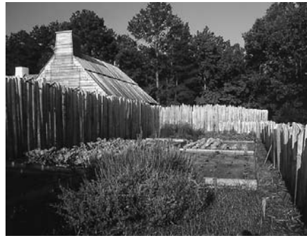
Fort Toulouse—Fort Jackson State Historic Site

wonder who he was and why he is so important?”